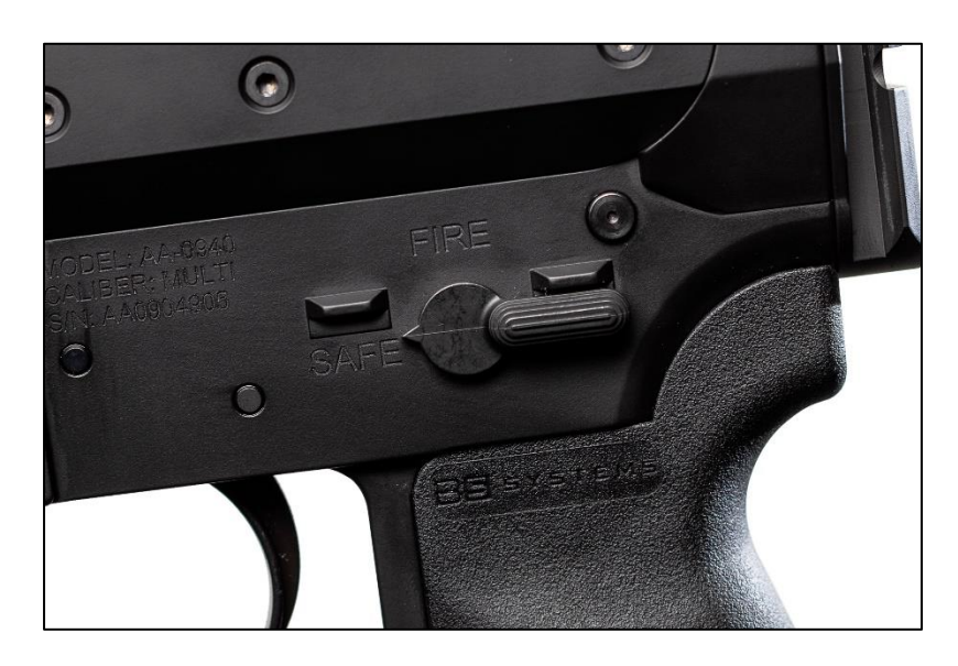
Point the firearm in a safe direction and place the safety selector on "SAFE."

Perform this operation prior to cleaning, maintaining or storing the firearm.