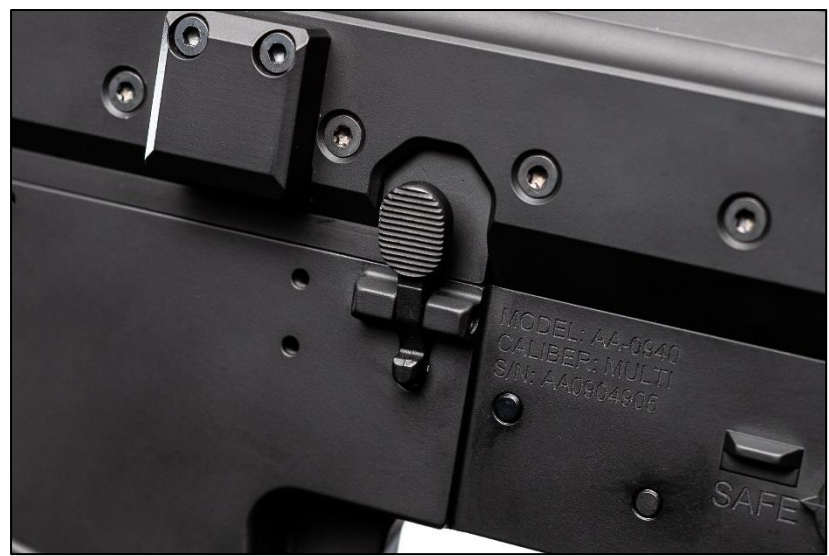
Pull the charging handle all the way to the rear and press the bottom portion of the bolt catch. Release the charging handle. This locks the bolt in the open position.