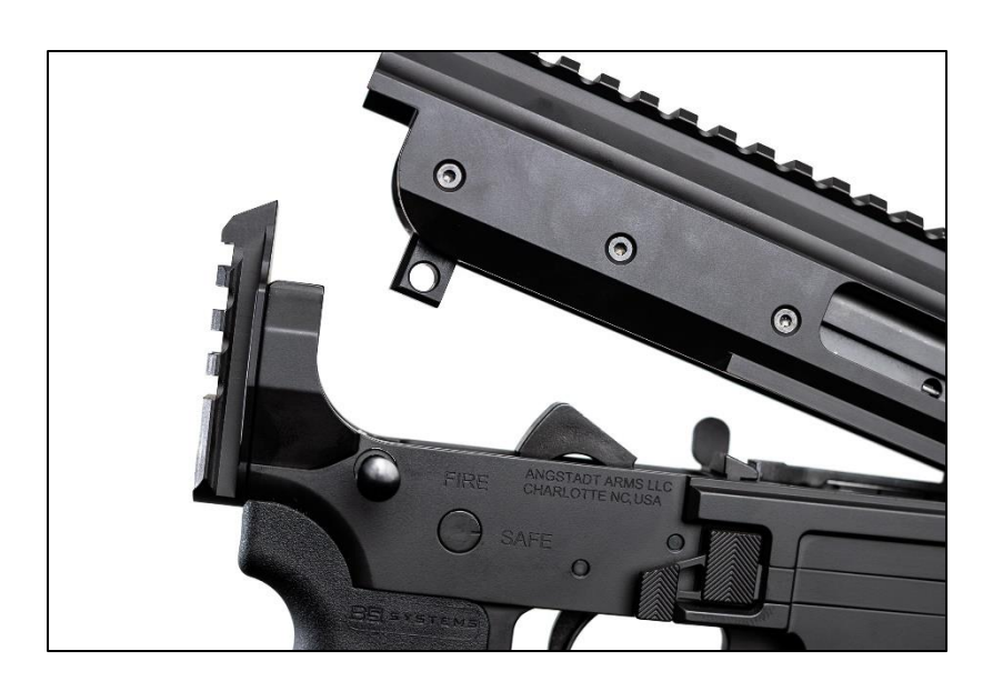
Grasp the upper receiver and pull upward, allowing it to pivot forward.