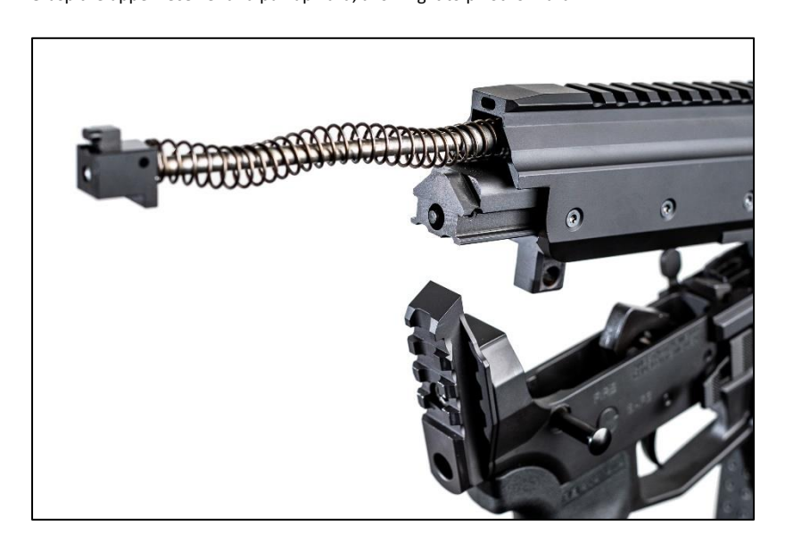
WARNING: BOLT CARRIER ASSEMBLY IS UNDER COMPRESSION